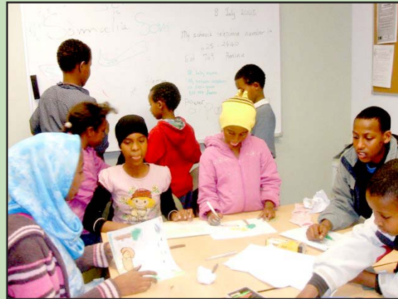
Holiday program participants

awareness around health, food and nutrition.