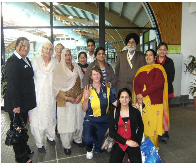
Orientation to Manukau City Leisure and recreational facilities was one of the activities organised for newcomers in Manukau.

If you have any thoughts about what orientation Workshops would be helpful for newcomers to Manukau please let the Coordinator know.