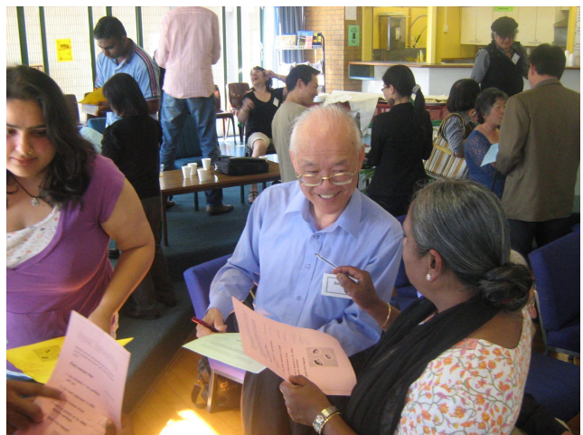
Speed networking was one of the fun activities organised at the end of year client get together