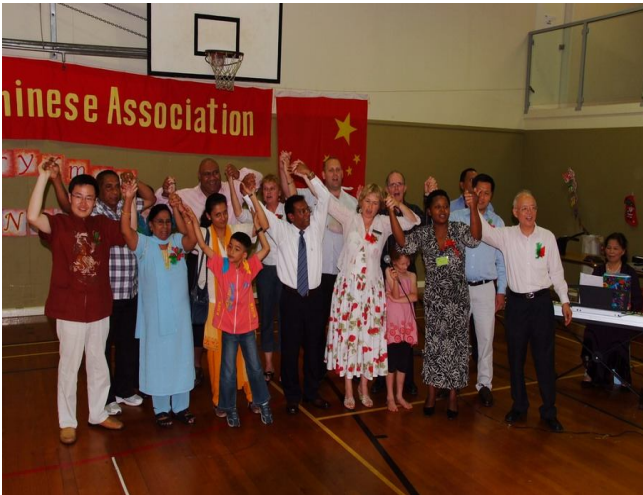
Pakuranga Chinese Association - Christmas celebration.

The Christmas celebration organized by the Pakuranga Chinese Association was attended by many other cultural groups from Manukau and was graced by members of Parliament and senior officials of government and NGOs. The SSN Coordinator for Manukau was one of the invited guests and joined in the singing of the National Anthem at the end of the event. The group comprised one representative from each nationality present on the day.