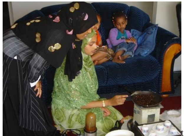
Oromo Community - Coffee making ceremony

Settlement Support Coordinator for Manukau City on: 021 260 9459