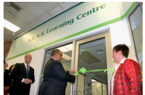
opening of the learning centre

ARMS' accomplishments this past year have been possible only through the concerted and weighty efforts of staff, trustees, volunteers, colleagues in our collaborating organisations, and our funders. My whole-hearted thanks to all concerned for your contributions to the mission of facilitating the successful settlement of newcomers and new Kiwis and valuing their contribution to the Auckland Region.