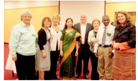
Citizens Advice Bureau Language Link Staff members.